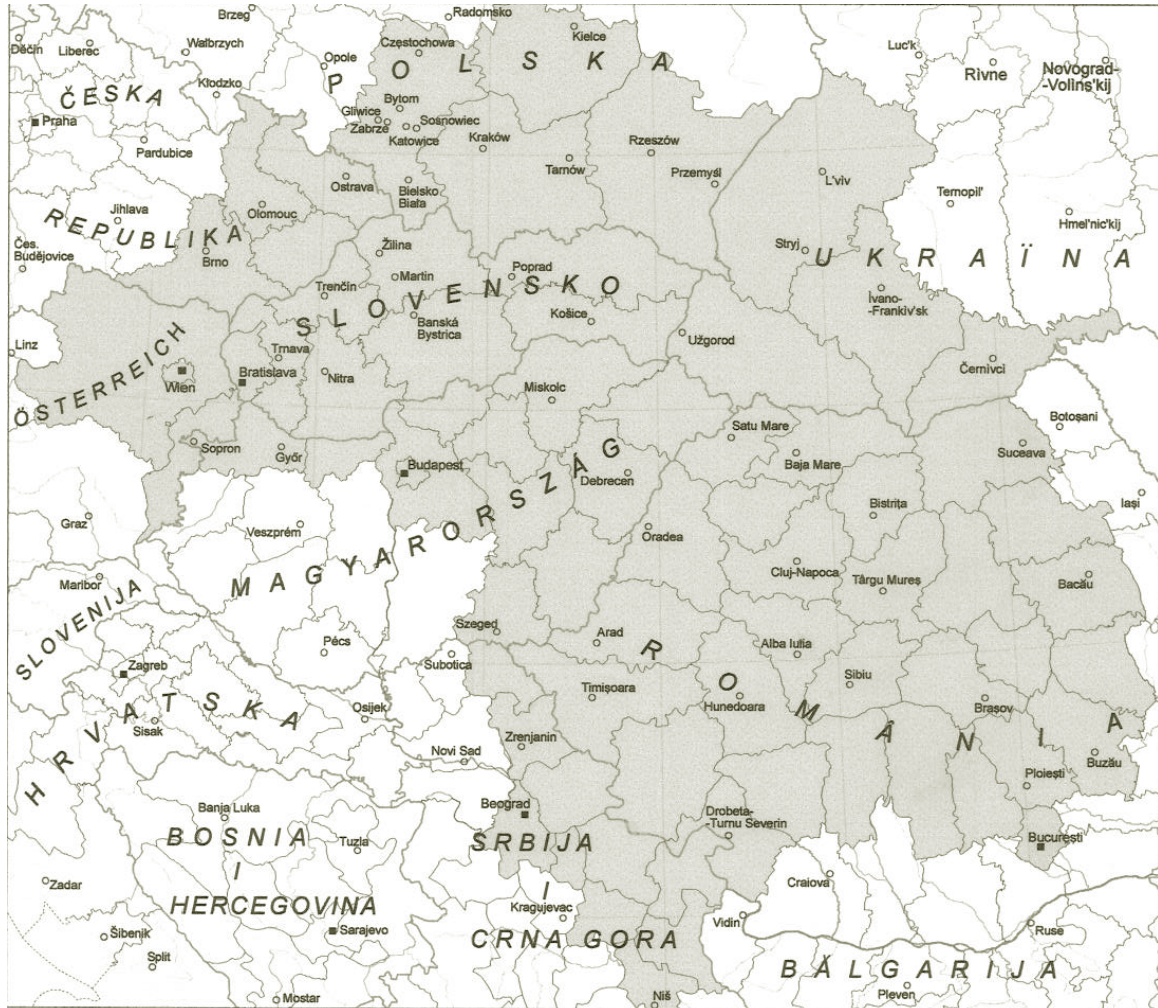
Map of the Carpathian Area