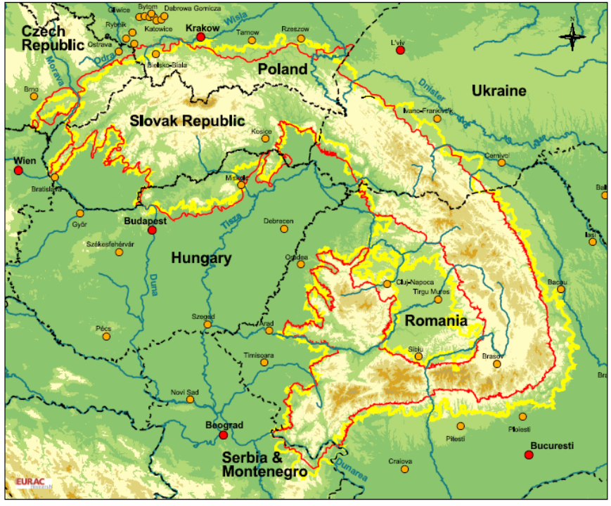
Delimitation proposal: Approach B (Chap. 7.3.2)

EURAC research EUROPÄISCHE AKADEMIE ACCADEMIA EUROPEA EUROPEAN ACADEMY BOZEN - SÜDTIROL