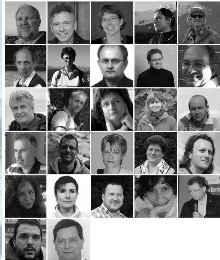
S4C Scientific Steering Committee