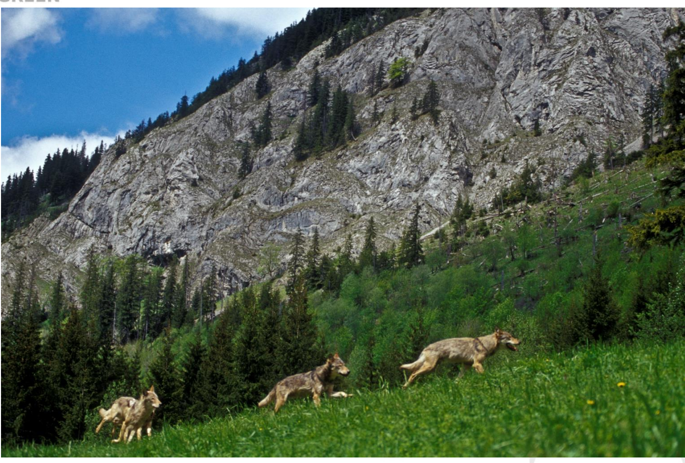
Project co-funded by the European Regional Development Fund (ERDF). www.interreg-danube.eu/transgreen