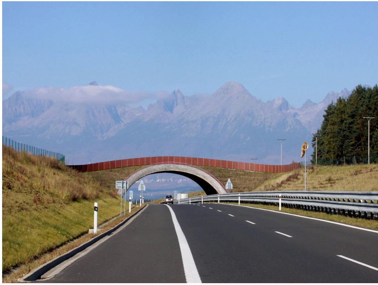
Project co-funded by the European Regional Development Fund (ERDF).