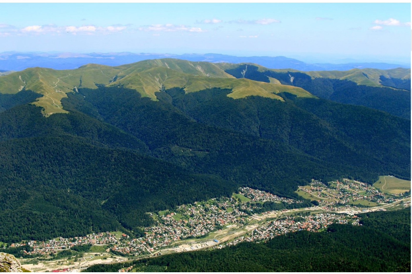
Project co-funded by the European Regional Development Fund (ERDF). www.interreg-danube.eu/transgreen