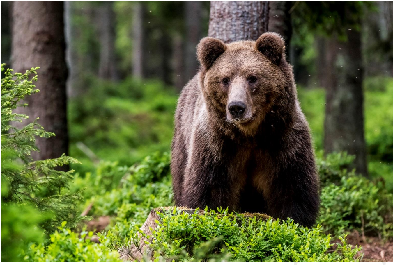
Project co-funded by the European Regional Development Fund (ERDF).