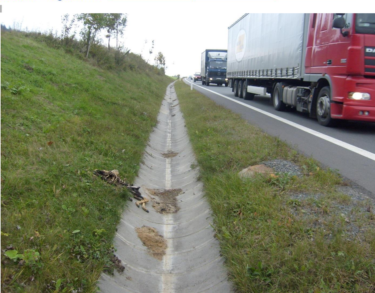
Project co-funded by the European Regional Development Fund (ERDF). www.interreg-danube.eu/transgreen