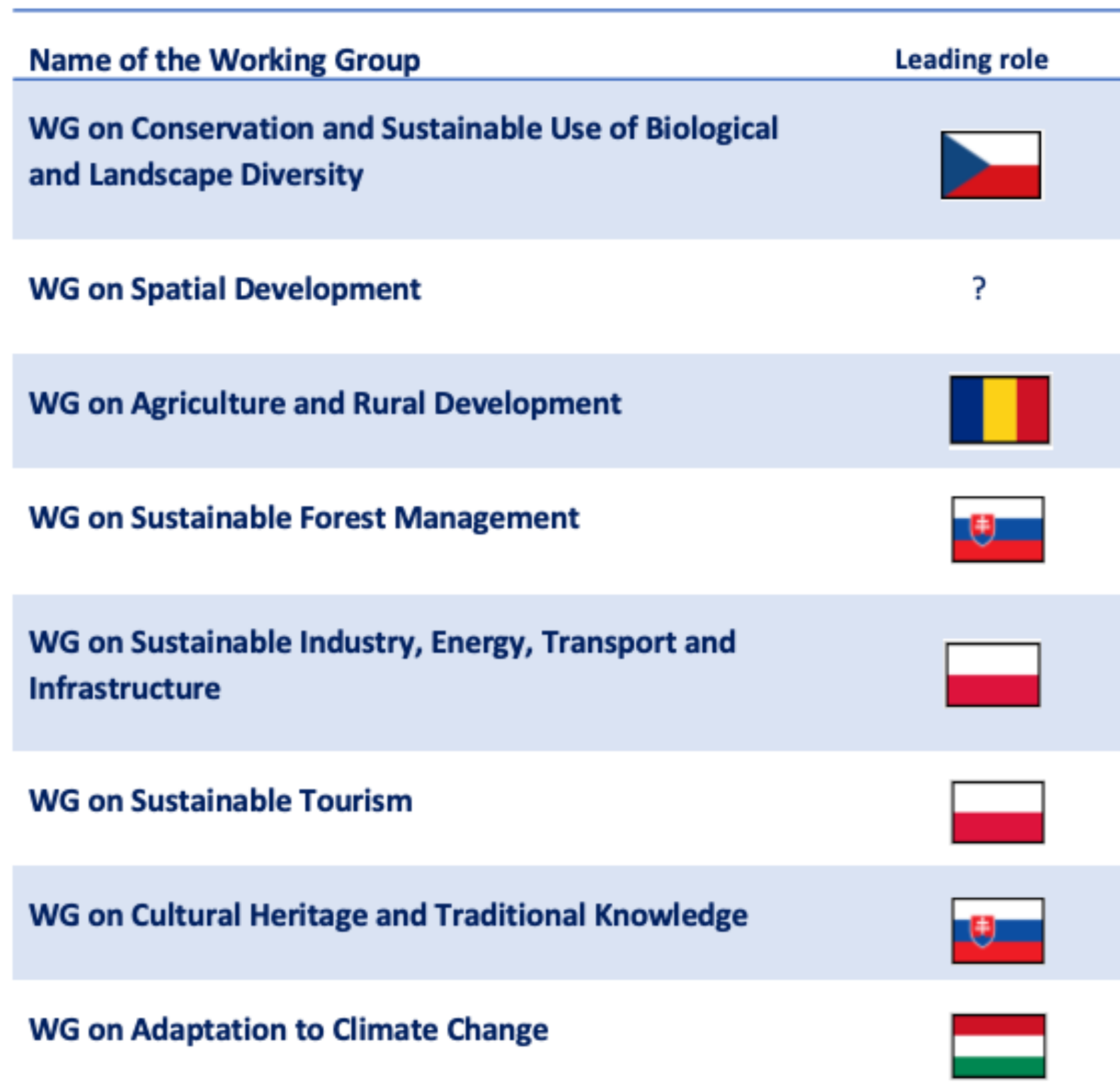
Table indicating the Carpathian Convention Working Groups and the Parties taking the leading role of them for the period of 2021 – 2023 (from COP6 to COP7)