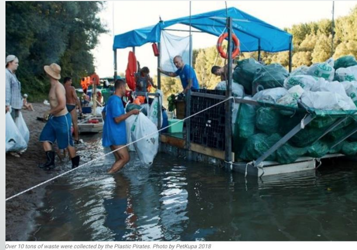
Over 10 tons of waste were collected by the Plastic Pirates.