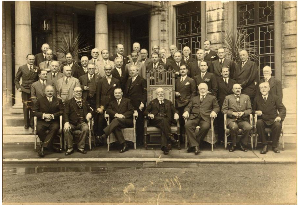
CIC, 1935 Brussels

Registered in 1930, in Paris, France - Conseil International de la Chasse