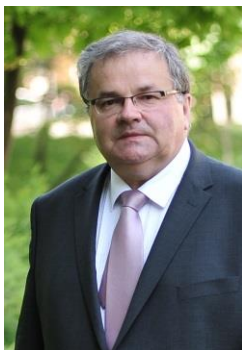
Stanisław Ożóg - Member of the Sejm of the Republic of Poland