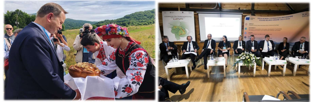
2 nd Carpathian Days of Good Neighbourhood - Meeting of the Carpathian Regions 8-10 August 2019 in Muczne, Poland