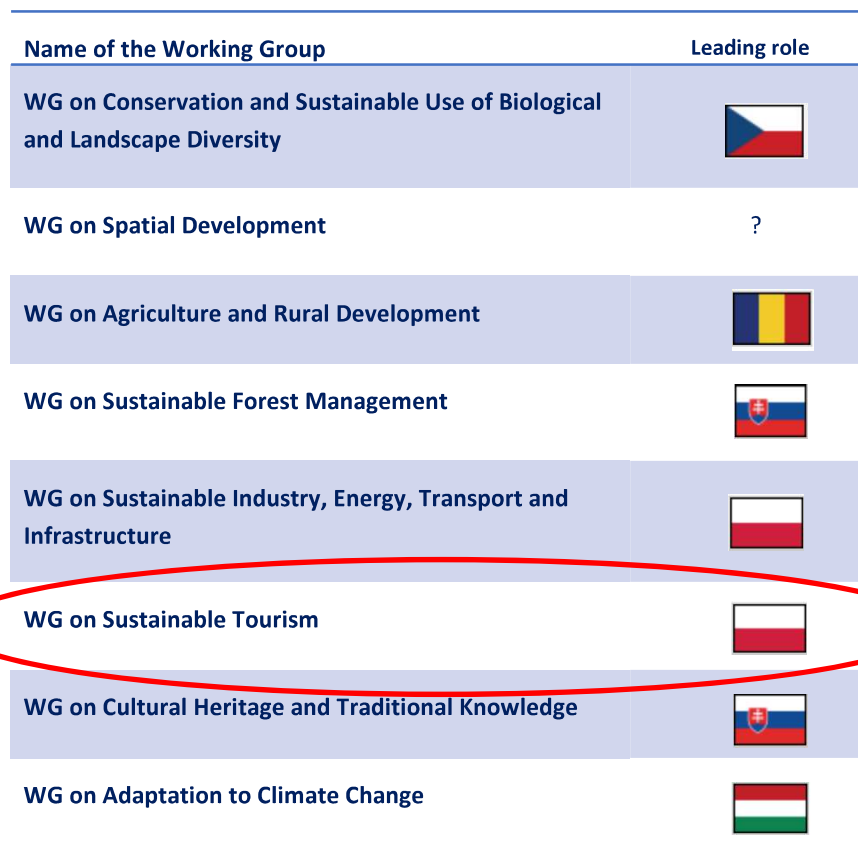
Table indicating the Carpathian Convention Working Groups and the Parties taking the leading role of them for the period of 2021 – 2023 (from COP6 to COP7)