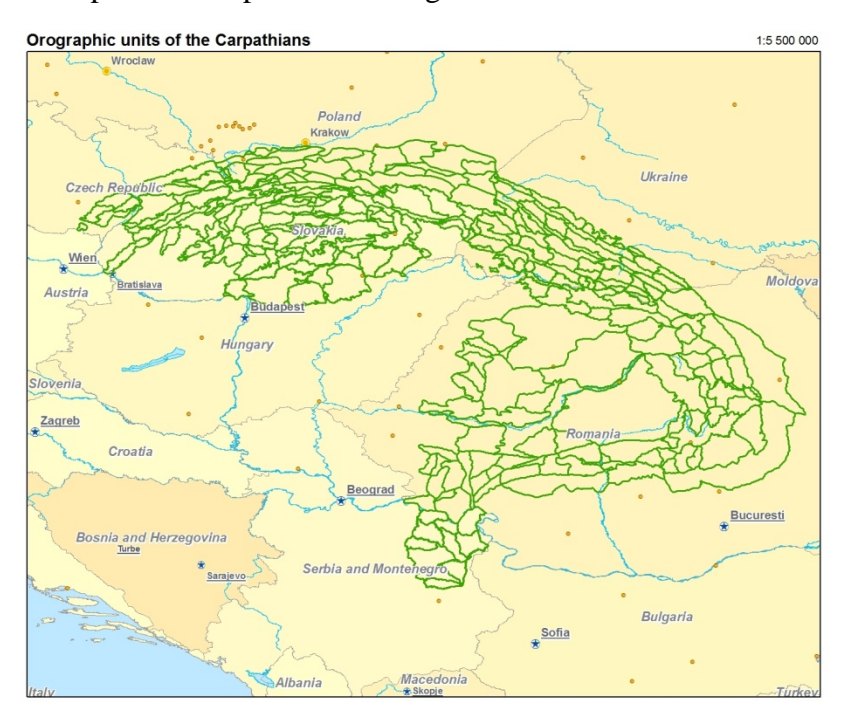
Figure 1. Map of the Carpathian eco-region as used in the CBIS.

The boundaries of the Carpathians as proposed for the purpose of this assessment are shown in Figure 1. This map was used in previous projects for development of the Carpathian Biodiversity Information System (CBIS), this includes borders of 309 orographic units and the organisation of data collection can be compatible with previous Carpathian projects. This can serve as a basis for data gathering and display the species distribution, and is available on <a href="https://www.carpates.org/cbis/orogs.html">www.carpates.org/cbis/orogs.html</a>. The details and GIS layers will be provided by the PP9.