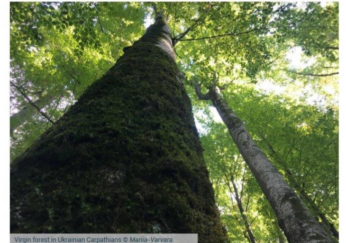
Virgin forest in Ukrainian Carpathians

ASSESSMENT OF CLIMATE RISKS AND ADAPTATION OPTIONS FOR CARPATHIAN FOREST ECOSYSTEMS AND THEIR SERVICES