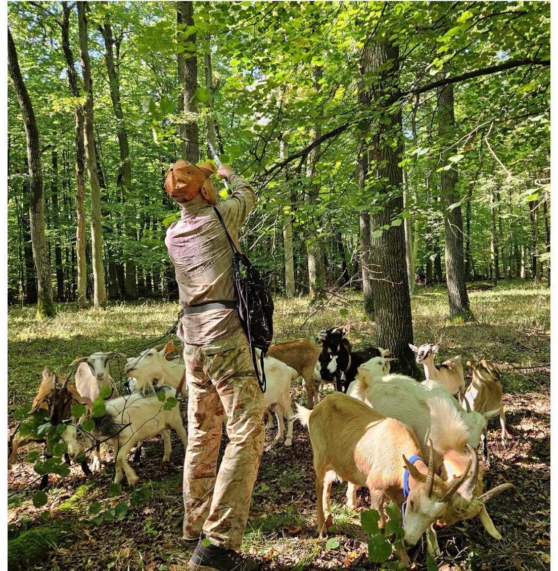
Wood pasture near Rzeszow.

Building of public awareness, recognition, and appreciation of the role of traditional agriculture as a unique provider of a wide range of biocultural benefits are required. This awareness should be reflected in an appropriate legal and economic framework that provides traditional agriculture with the necessary autonomy and freedom from bureaucratic constraints.