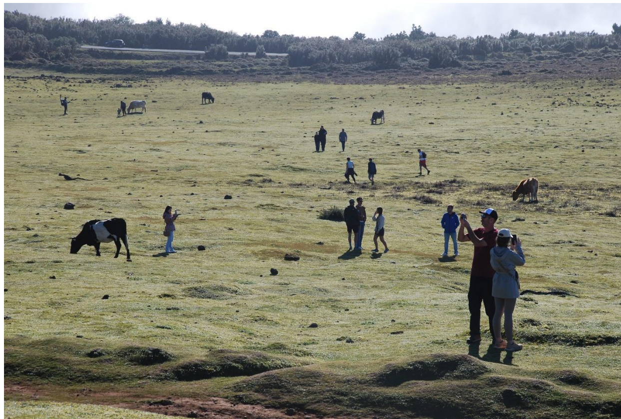
Fanal pasture, Madeira

Wherever tourism becomes the major industry, it leads to disneylandisation and cultural colonisation of rural communities.