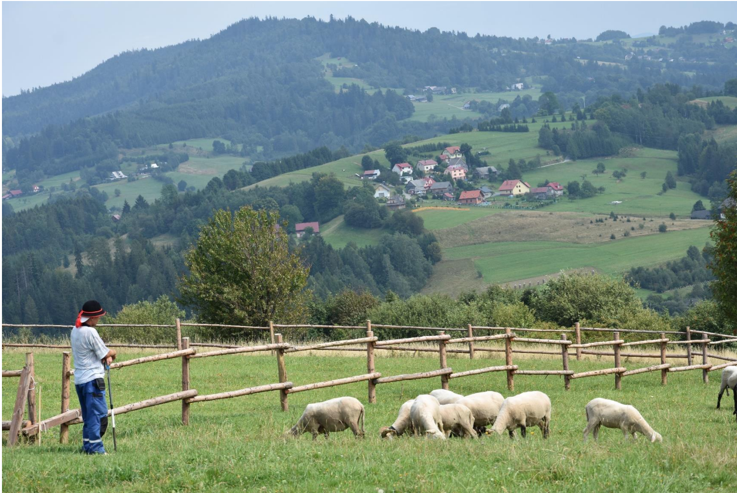
Pasture in Beskid Śląski.

Traditional farming supports sustainable tourism in mountainous areas and grazing is its main component